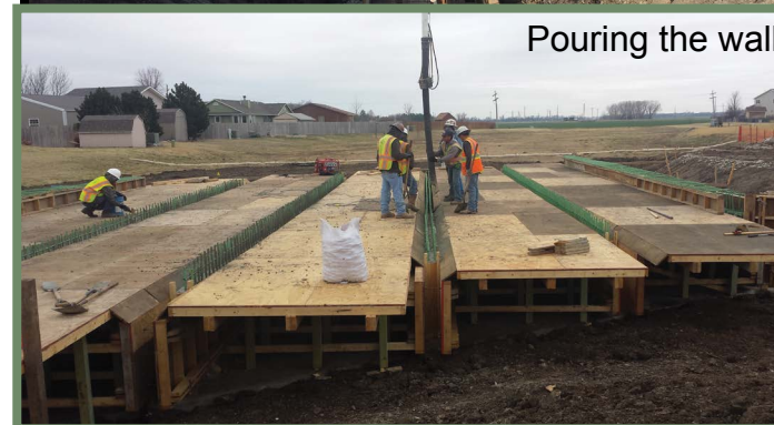
Pouring the walls