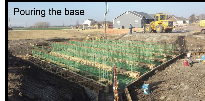
Pouring the base