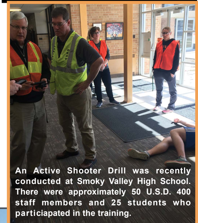
An Active Shooter Drill was recently conducted at Smoky Valley High School. There were approximately 50 U.S.D. 400 staff members and 25 students who participated in the training.