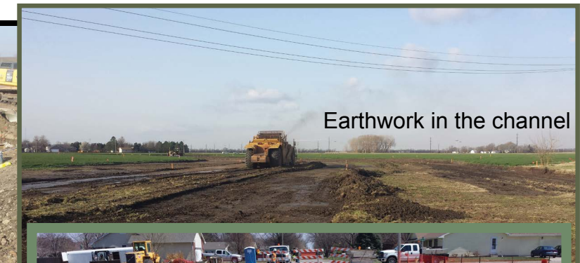
Earthwork in the channel