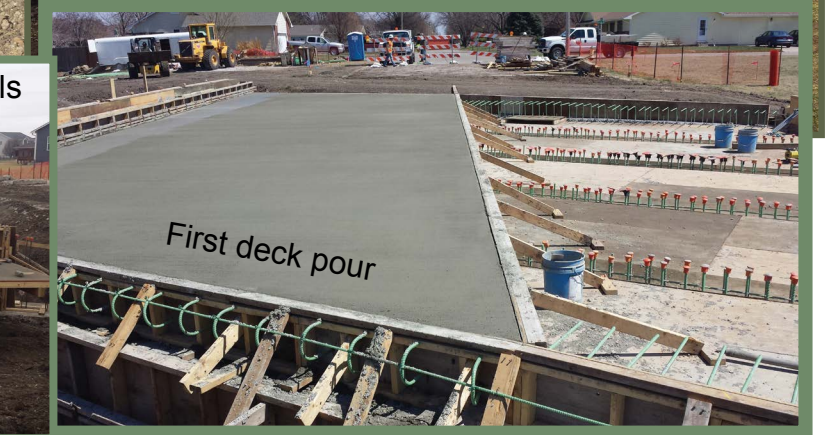
First deck pour